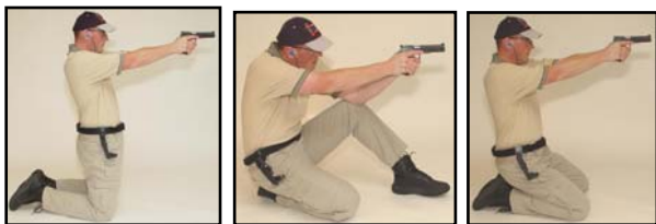
Additional Police Kneeling Examples