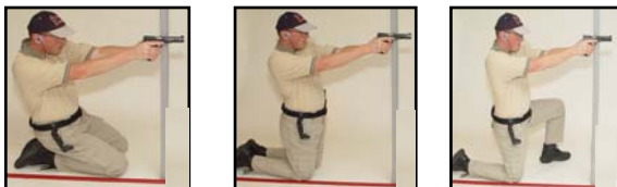
Kneeling With Cover & Support Examples