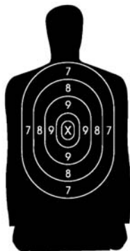
NRA B-27 Law Enforcement Target